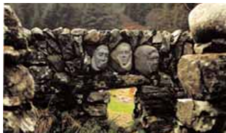
Quorum, depicting carved stone heads, can be found in old sheep pens in Galloway Forest Park